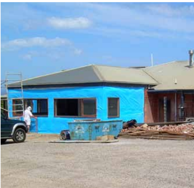
Aireys Pub in mid November 2011