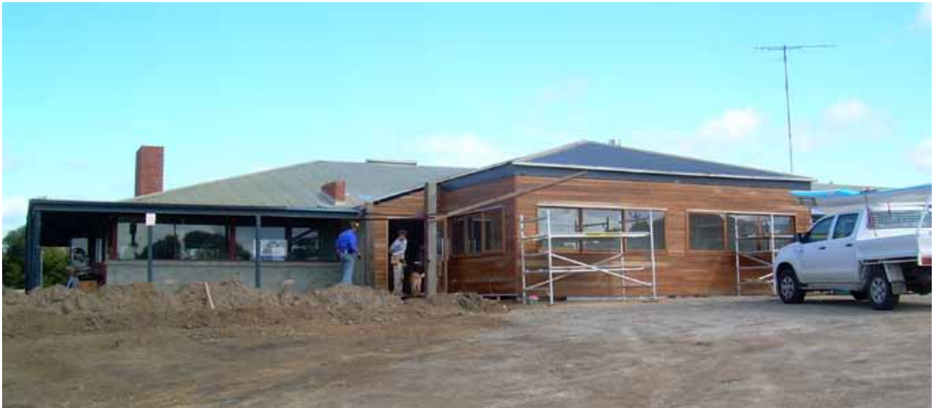
Aireys Pub in early December 2011