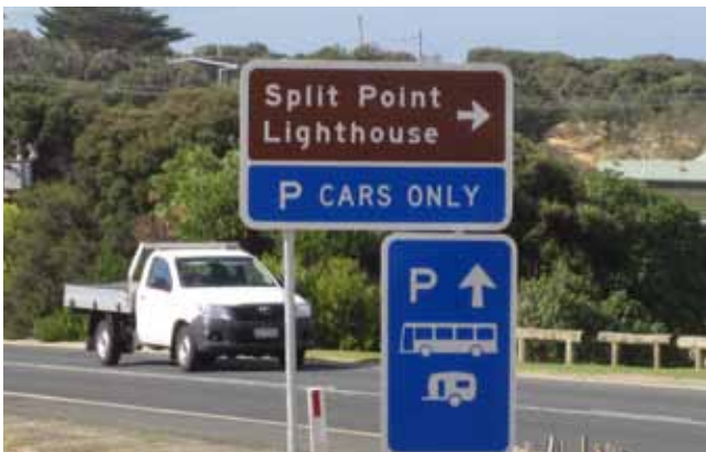
Signage directing long vehicles to the parking bay on the Great Ocean Road and cars into the reserve car park.

While the current position of two parking spaces may not be ideal, a long-vehicle parking area further along the Great Ocean Road has been suggested. Council is proposing a shire-wide review of long-vehicle parking, and AIDA is looking forward to discussing this alternative with council officers.