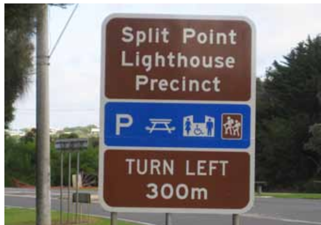
New signage heading west along the Great Ocean Road

After many years of discussion, new signage was finally erected in the Split Point Lighthouse Precinct at the end of April this year, and seems to be having a beneficial effect on traffic in the precinct, although the full effect of the signage will not be apparent until after the next summer season. Significant changes include the restriction of buses over 6 metres from parking in the precinct, and the development of the Aireys Inlet Reserve car park.