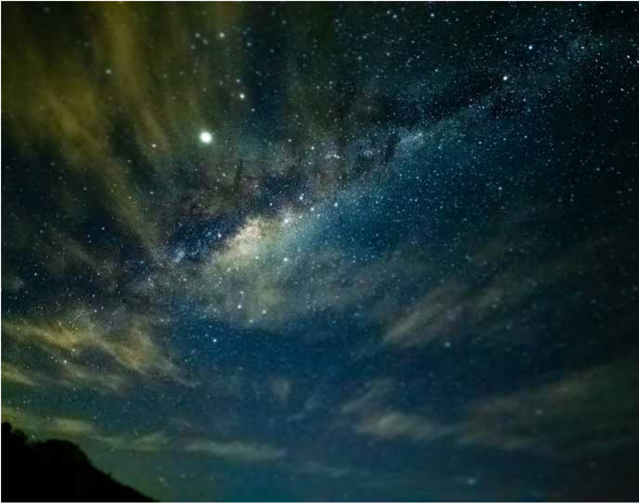
Night sky at Cape Shank by Sally Webber; the very bright dot is Venus

Aireys, while not remote, is ideally placed to offer dark-sky tours to visitors. Because of the proximity to Melbourne, and minimal lighting, astrotourism is perhaps something that could be developed as a way to encourage visitors to stay longer and explore the area, the sort of tourism that offers regeneration rather than degradation.